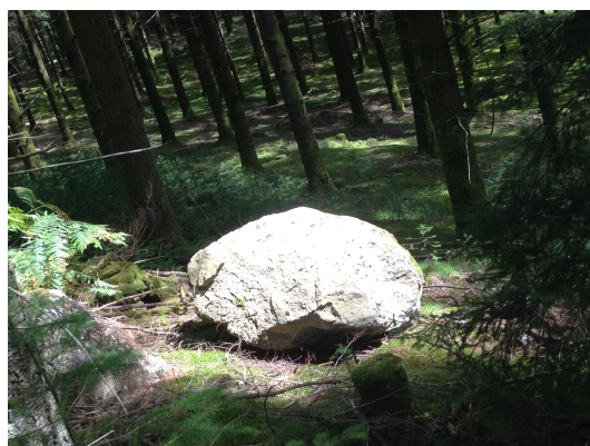
Figure 6: Object, Corrèze, 2014.

The plateau de Millevaches is cloaked with dense forests and dark woods. Nettles sting my ankles as I walk over the brow of the hill. Crystalline air cools my nostrils and makes my skin tingle. Pools of light illuminate the sparsely populated Corrèzian paysage , an undulating patchwork of granite, purple wild thyme, splatters of yellow gentian and the languorous Limousine cattle. The ubiquitous Douglas pine lines up against ancient hairy oak trees, lichen-cloaked beech, spear-leaved sweet chestnut. 17 I enter a dense sunless copse and am absorbed into a strange stillness. The trees look back at me. For a moment, I gaze at a sunlit, luminescent rock.