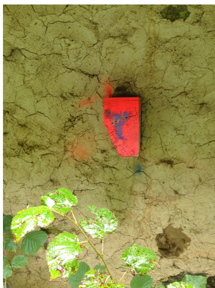
Figure 1: Sign, Corrèze. 2014.

Georges. 3 Besides les bonnes fontaines , 4 traces of the region's distinctive folk mythologies and histories of pagan rites and sorcery 5 linger in the roadside crosses and votive objects.