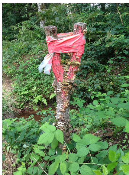
Figure 2: Sign, Corrèze. 2014.

https://www.youtube.com/watch?v=HXZ4_0UxRCI&feature=youtu.be