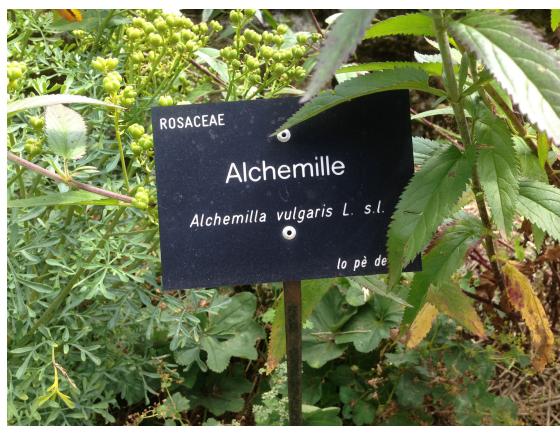
Figure 7: Sign, Vassivière, Haute-Vienne, 2014.

An hour or so away, an exhibition of contemporary artwork, Things Unseen , is showing at the Centre International D'art et du Paysage de L'île de Vassivière on the Isle of Vassivière in Limousin. To get there, you drive through a landscape crisscrossed with the ghost tracks of armed resistance fighters, as these forests once harboured clandestine groups of Maquis. 18 The exhibition, dwelt on themes such as water, wood and waste but related projects featured 'secret-hide-outs', resonating powerfully with the unseen radical political histories of the landscape. 19 There is a residue of those things 'unseen', an affective presence of absence, in the trees, in the strange stillness, in the luminescent rocks of Corrèze. How might we apprehend the un-seen and the un-known?