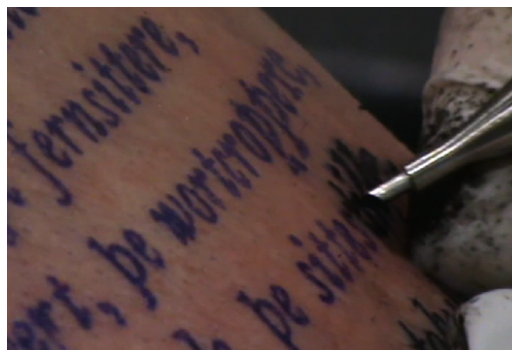
Figure 4: Names of the hare.

Audience members at Alchemy/Schmalchemy's Manifestation IV (Showroom, Sheffield, 2013), look down at the ice-cubes melting in their hands, revealing a line of text from the poem. The frenzied activity of a small printing press produces a cartoon image of a melting ice-cube enfolded in a shred of lichen gathered from the forests of Limousin. A cacophony of saxophonic shrieks reduces to a muffled squeal as a huge ice block, suspended from a ladder with rope, melts into an aluminium bucket. Each amplified drip goes off like a gunshot. Eventually, the barbed wire tension snaps. Ice crashes into metal. A palpable exhaustion and stillness descends.