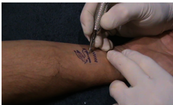
Figure 3: Hare.