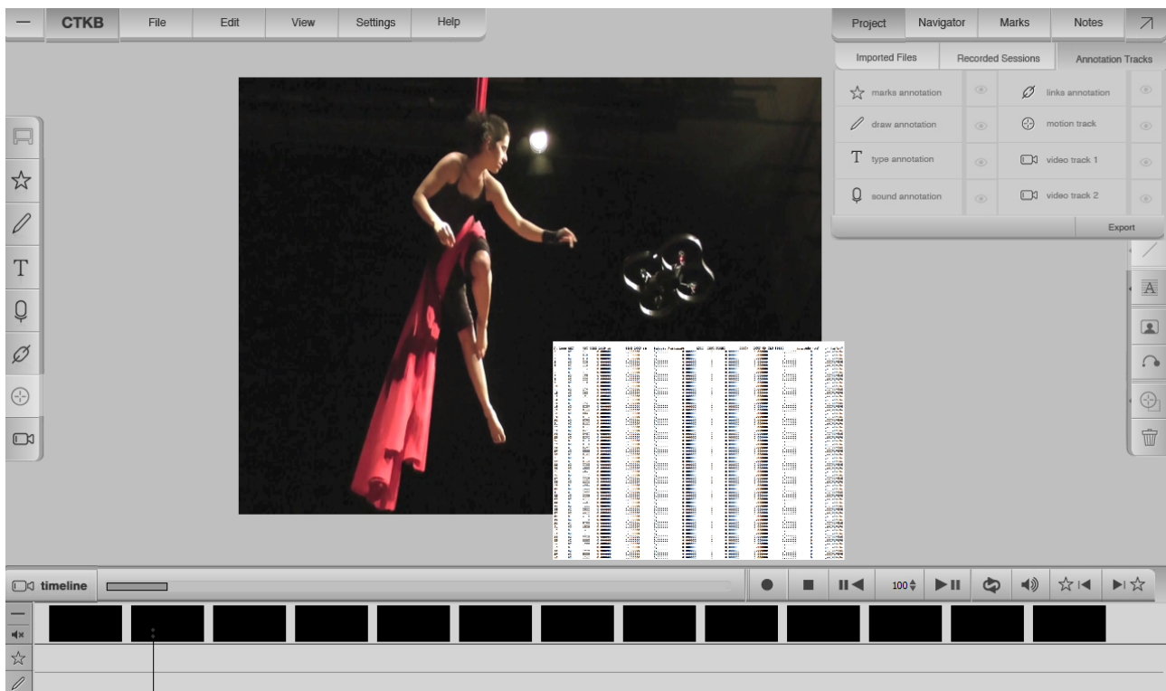
Figure 3: Creation Tool hypermedia note feature (attached AR.Drone data sheet in this example)

Figure 3 displays an annotated frame of another rehearsal video, presenting the hypermedia attachment feature of the Creation Tool. The annexed AR.Drone data sheet contains recorded flight details, which we use to edit artistically compelling moments and store them in a database as ‘behaviors’ that can be used interactively. It goes without saying that different types of documents can be attached, as well as hyperlinks be set. In our example, technical details of the flight data were attached to look into the expressive potential of the flying robot at this particular point in time.