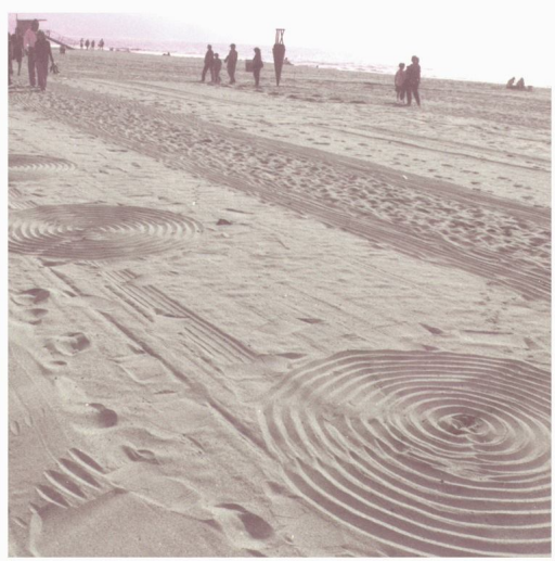
Sands of Time