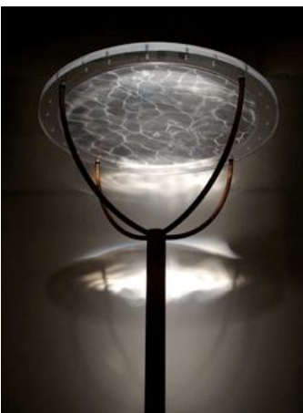
Ned Kahn, Seismic Sea used with permission by Ned Kahn Studios.