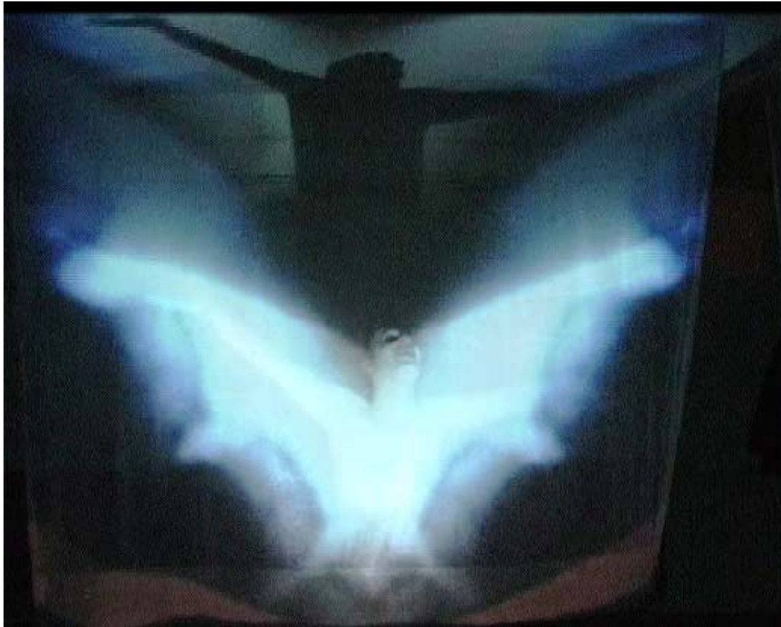
Amsterdam Cyber Theatre in STEIM, 30 th October 2005