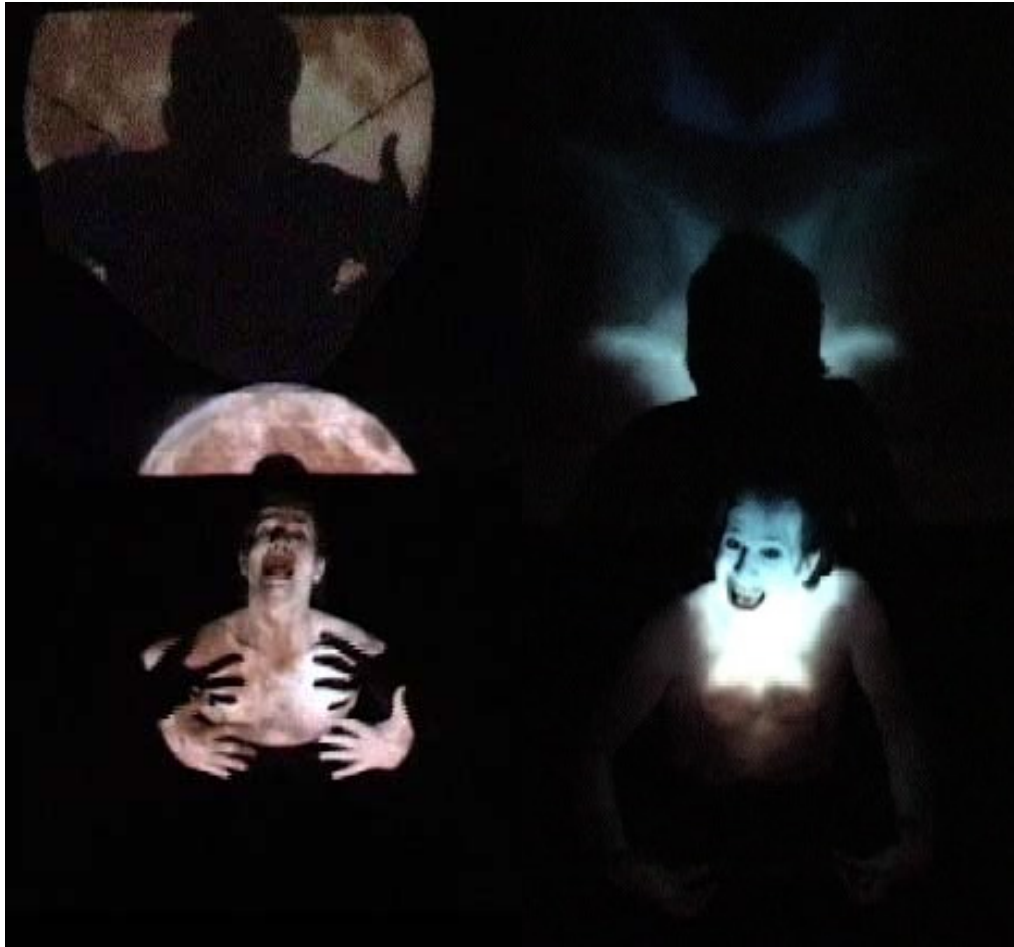
Amsterdam Cyber Theatre in STEIM, 30 th October 2005

Directing / Video / Set Design - Fahrudin Nuno Salihbegovic