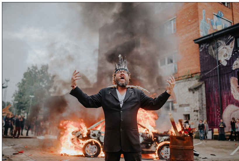
Figure 5: Non Grata performance Force Majeure , Tallinn, 2016

Here we see in Figure 5 , one of Non-Grata's academy members in a safe reconstruction of a very real experience. Using tools akin to circus, low-tech, makeshift, rebellious, and primitive, but vital. Their anti-establishment and non-hierarchical performance methods ensure teachers and students alike, live, think, and make together, a 'school of life conduct and survival rather than a traditional art school', (Avgitidou, 2023:185). So, I will end this review with a final provocation, in that perhaps the future of performance art and education lies within these very practices, wherein deep relational encounters (Bell, 2022), intermingle across species and borders, activating new forms of performance pedagogies, ecologies and opportunities for hybrid and humanitarian change.