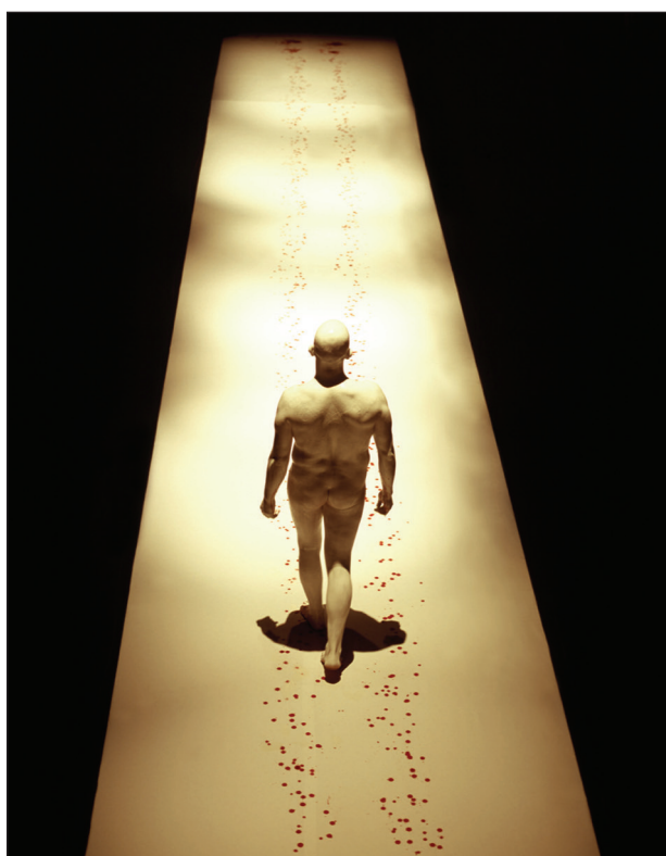
Figure 2: Franko B, I Miss You , 1999–2005.

has a featured work, followed by reflective questions. Although the artists referenced are predominantly well known and western-European (with a few exceptions), the provocations are often brave. Considerations such as how a performance artist organises their relationship to viewers; acts of intimacy; personal disclosures, and what impact that has on spectators/participants in terms of risk and benefit. Also, how aesthetics, staging, symbology and scenography invite audience engagement. She also asks her reader to consider, how the body can be used as a site and carrier of actions and messages and what the role of performance documentation or lack of capture has on the message being conveyed.